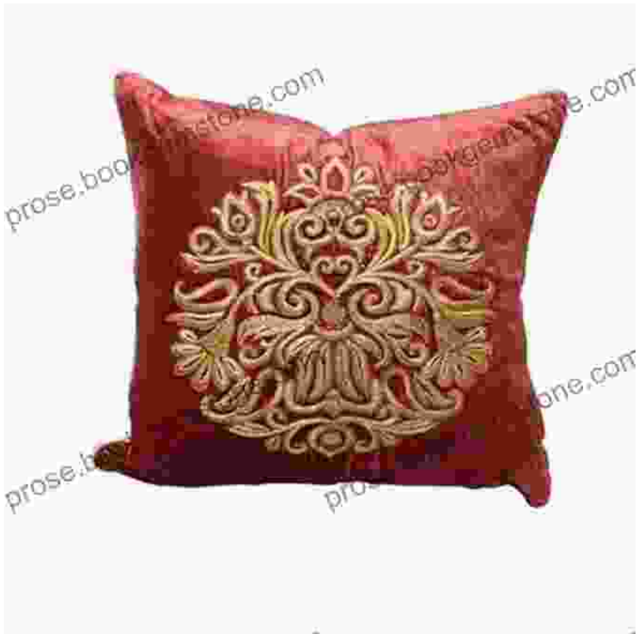
Ornate Embroidered Cushion Cover

process of creating this sophisticated centerpiece that will add a touch of luxury to your home decor.