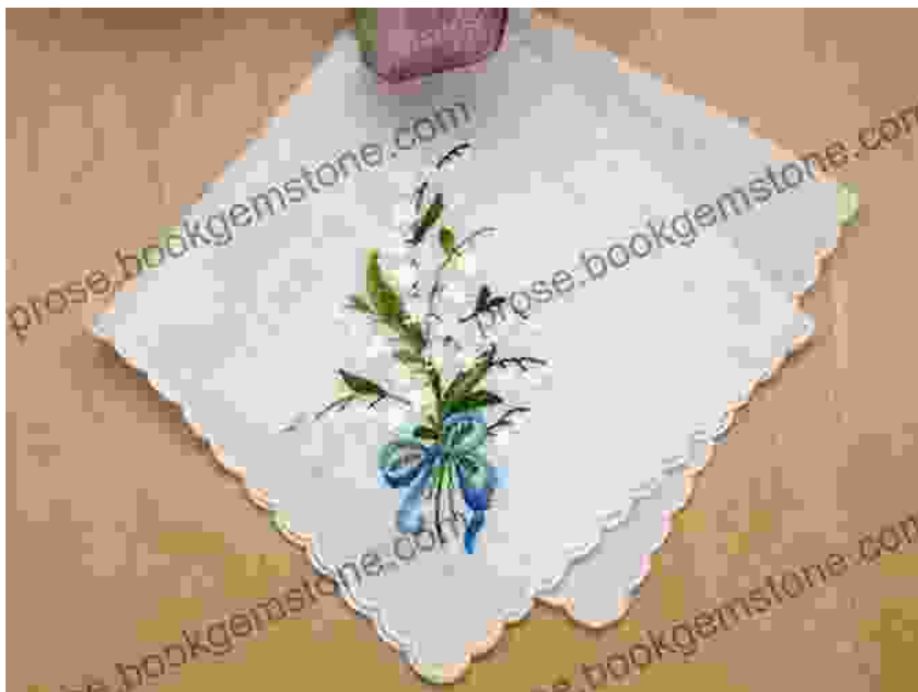
Embroidered Lace Handkerchief

Add a touch of vintage charm to your accessories with an exquisitely embroidered lace handkerchief. This delicate project features an intricate pattern of lace stitches, combined with subtle floral embroidery. Step-by-step instructions will guide you through the process of creating this heirloom piece that will be cherished for generations to come.