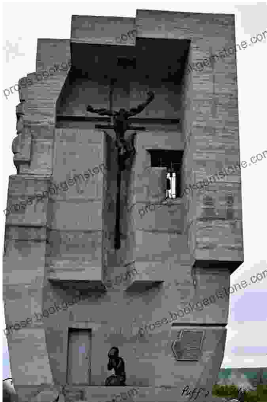
Mask of Sorrow, by Ernst Neizvestny, 1995.

Neizvestny's sculptures are often characterized by their monumental scale and their use of abstract forms. He was inspired by a wide range of sources, including ancient Egyptian art, the Renaissance, and the work of modern artists such as Pablo Picasso and Alberto Giacometti. Neizvestny's sculptures are often powerful and evocative, and they explore themes such as suffering, hope, and the human condition.