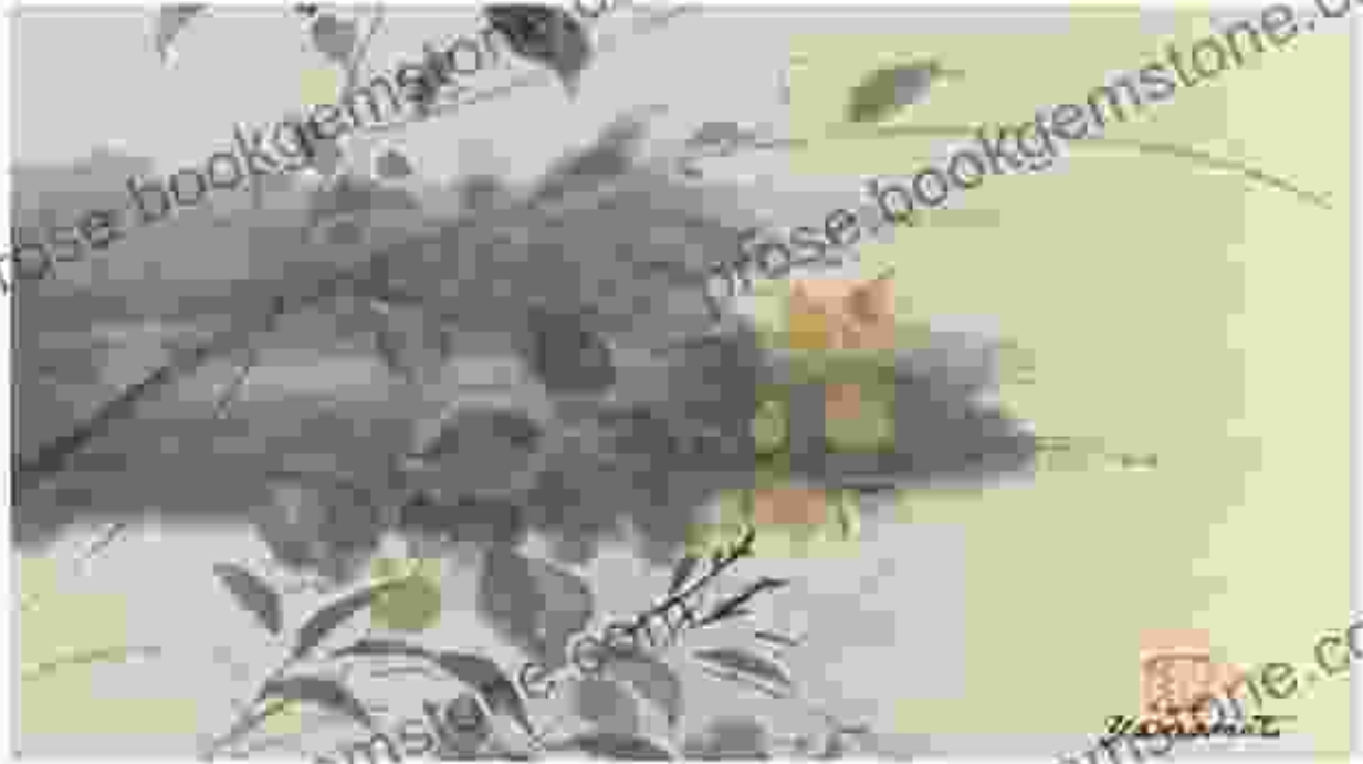
Hiroshi Yamamoto Sumi World painting