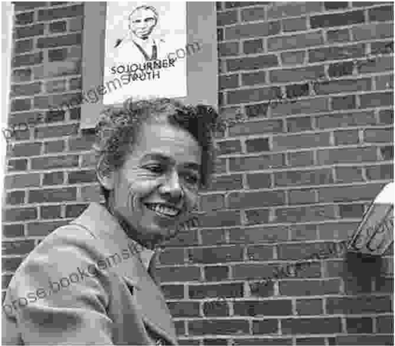
Pauli Murray at a civil rights protest

Murray's legal expertise and passion for social justice led her to become a prominent figure in the Civil Rights Movement. She worked closely with organizations such as the NAACP and the Southern Christian Leadership Conference.