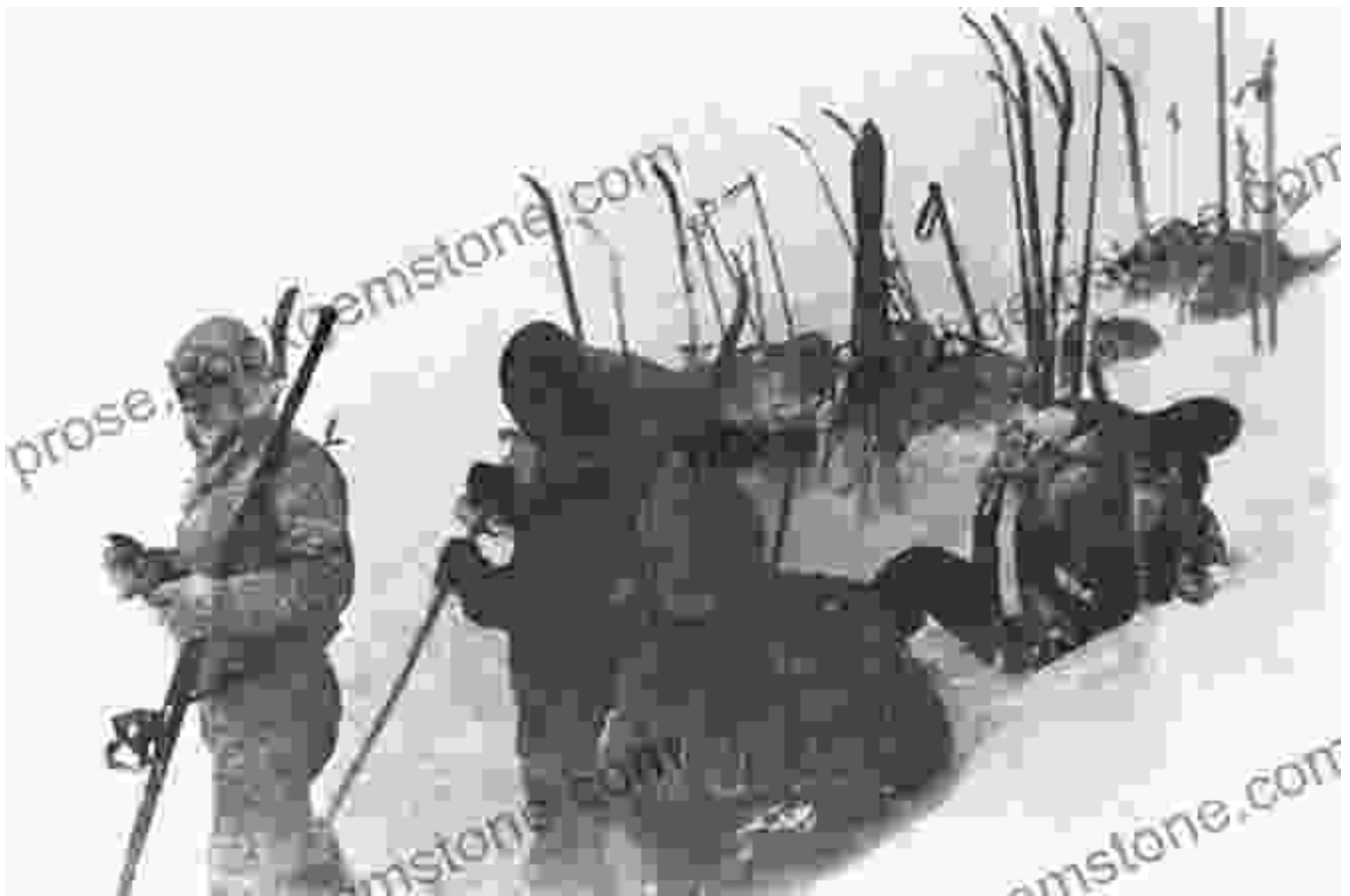
The Dyatlov Pass hikers set out on their ill-fated expedition.

to the incident, but the truth remains elusive, leaving a chilling reminder of the fragility of life and the enduring power of the unknown.