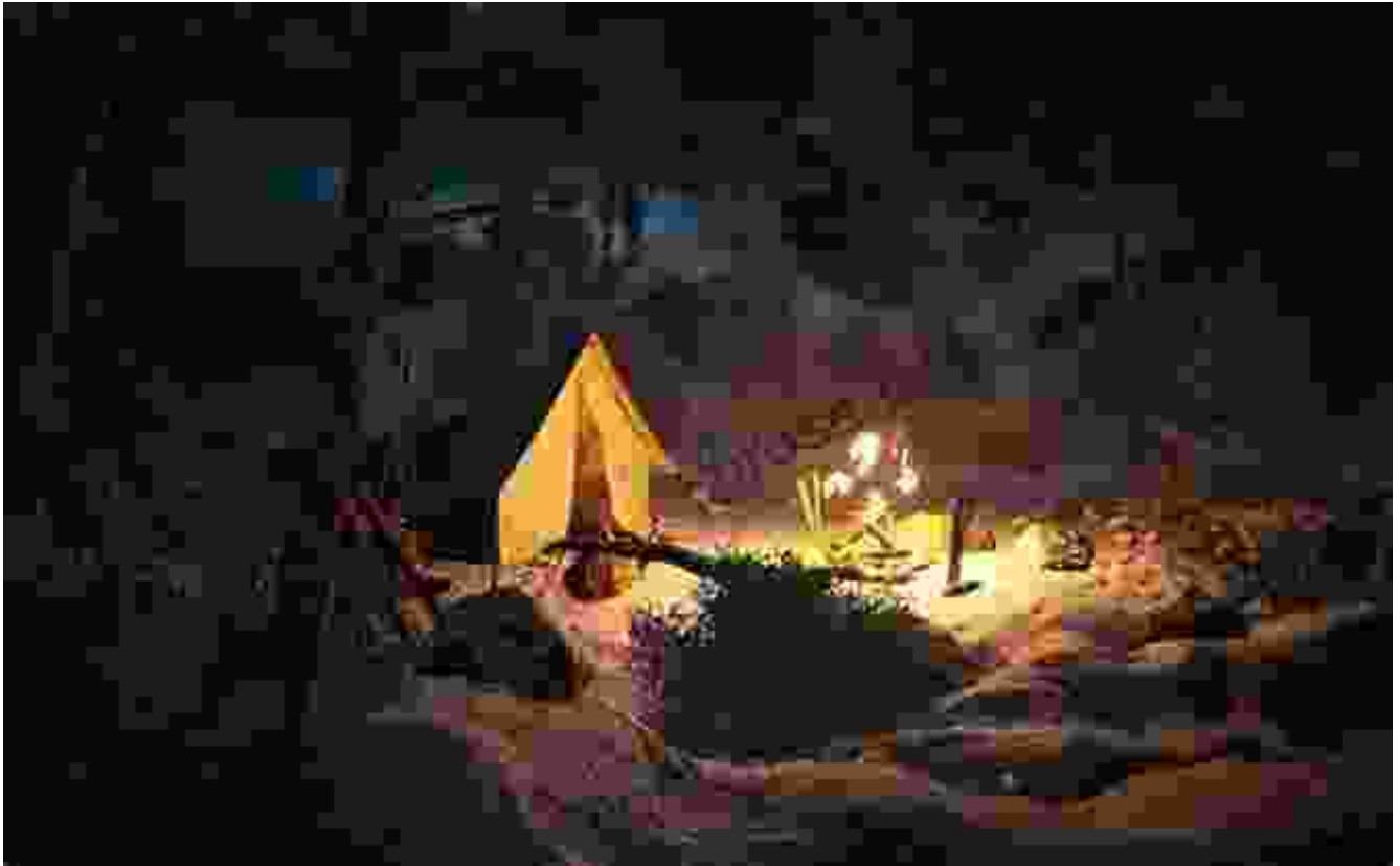
The hikers' tent was found abandoned, cut open from the inside.