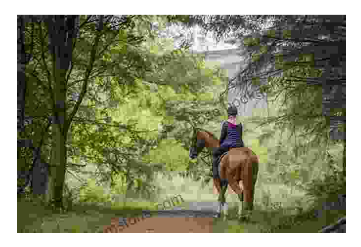
The Beauty of the Surroundings

At the heart of The Happy Bottom Riding Club lies the exceptional riding experiences it offers. With access to over 1,000 acres of stunning trails winding through forests, fields, and along riverbanks, riders of all levels can find their perfect adventure. The club's experienced instructors provide tailored guidance, ensuring that both novice and seasoned riders alike feel confident and supported throughout their journey.