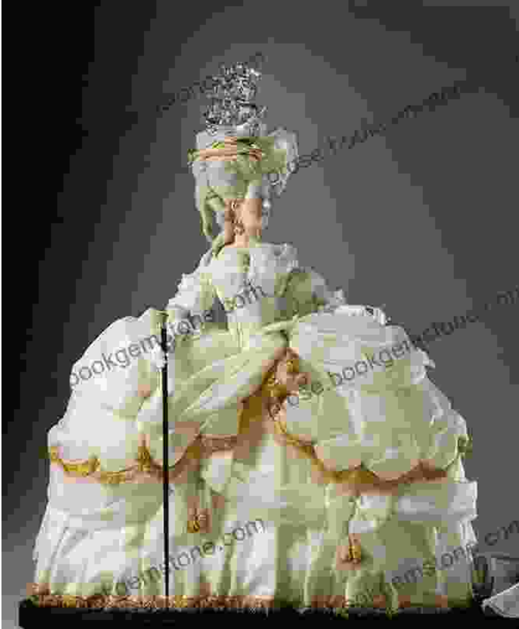
Marie Antoinette at the French court in a white gown and blue sash.

Marie Antoinette's fashion choices also reflected her political views. She was a strong supporter of the monarchy, and her fashion choices often made a political statement. For example, she often wore gowns in the colors of the French flag. She also wore gowns that were decorated with symbols of the monarchy, such as the fleur-de-lis.